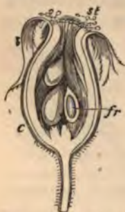
Fig. 13. ROSE FRUIT.

The Strawberry does not stand alone in its illustration of curious facts concerning the transformation of flowers which